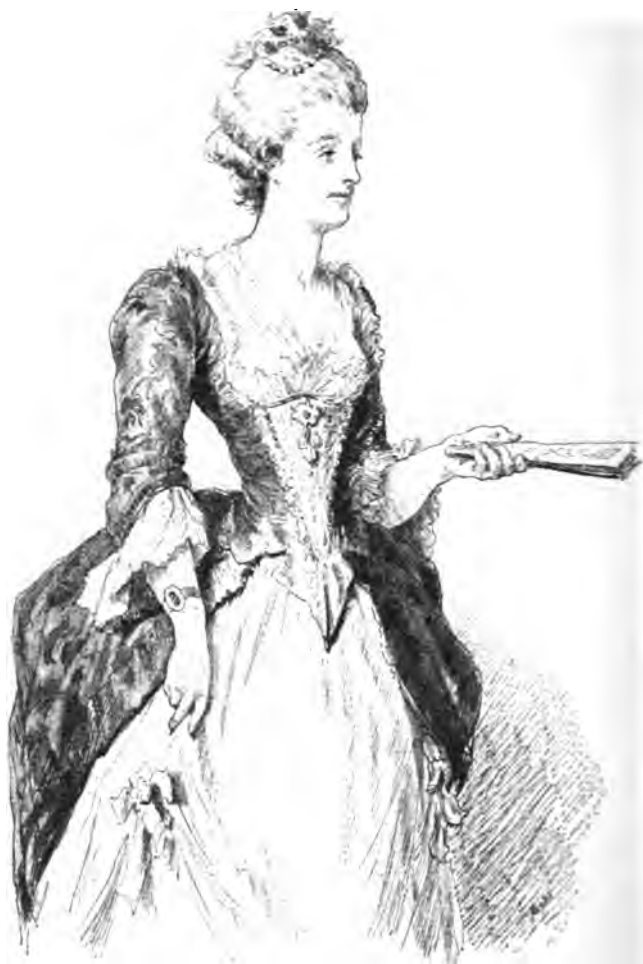
'Madame de Connal.'